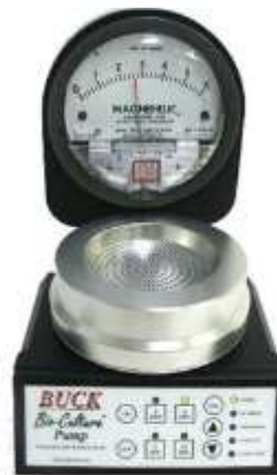
Calibration Head Attached to Pump

*Depends on battery maintenance, backpressure, etc.