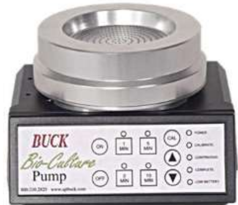
Model B30120 30-120 LPM Programmed Sampling for Bio-contaminants Sampling

The front key pad is organized into three functional key groups: Power (ON-OFF), Timing (1, 2, 5, 10 minute samples), and Calibration (Cal mode, Increase flow, Decrease flow). Positive tactile feedback is provided by the keys. The BUCK Bio-Culture™ Pump has internal NiCad batteries to provide a full six hours continuous run time at 100LPM. The standard smart charger provides a battery recharge in 2.5 –3 hours and allows the unit to operate on AC power. End of sample notice is provided by the lit LED “Complete” and three short beeps.